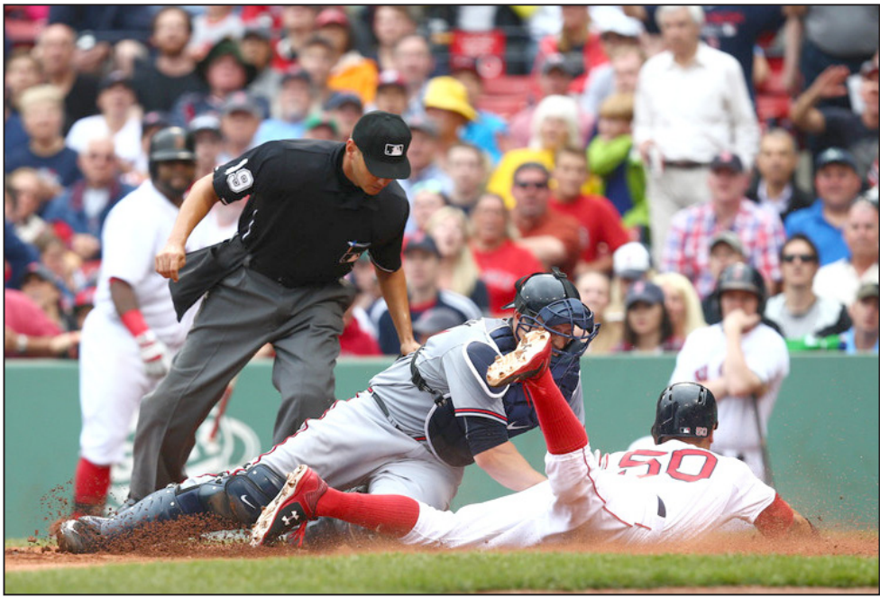
Boston's Mookie Betts (50) scores against Atlanta catcher Ryan Lavarnway during the sixth inning at Fenway Park on Monday in Boston.

Second baseman Brock Holt hit a solo home run to left an inning later. De